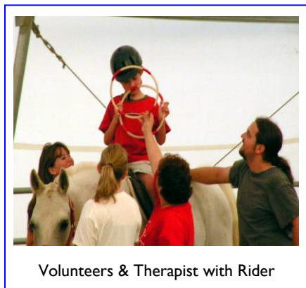
Volunteers & Therapist with Rider