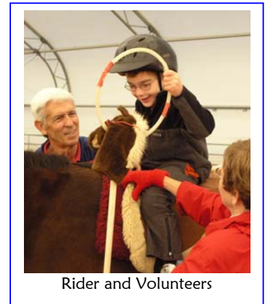
Rider and Volunteers

Each rider's individually created program is supervised and evaluated by therapists that are specially trained using the horse as a therapeutic tool. In addition to the physical gains from horseback therapy, parents and teachers often see improved speech patterns and lengthened attention spans. Our riders gain a sense of joy, freedom and empowerment from the therapy sessions, which enable them to sit tall and proud on the backs of our specially screened and trained horses.