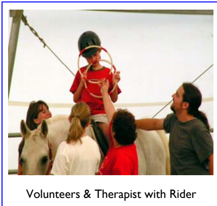
Volunteers & Therapist with Rider

A variety of community-supported activities are available to children without disabilities, from Little League and soccer teams to after-school social activities. Neurologically handicapped children need opportunities to develop their physical skills and learn to interact with their peers in community-supported activities as well. Ride To Walk is one of the few opportunities these children have to participate in a "special activity." It addresses this social need while providing crucial therapy that helps their bodies and minds to develop their fullest potential. While there are a variety of programs that put disabled children on horseback for recreational purposes, Ride To Walk is one of the few programs in this area that also focuses on the therapeutic aspects of this activity.