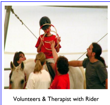
Volunteers & Therapist with Rider

A variety of community-supported activities are available to children without disabilities, from Little League and soccer teams to after-school social activities. Neurologically handicapped children need opportunities to develop their physical skills and learn to interact with their peers in community-supported activities as well. Ride To Walk is one of the few opportunities these children have to participate in a "special activity." It addresses this social need while providing crucial therapy that helps their bodies and minds to develop their fullest potential. While there are a variety of programs that put disabled children on horseback for recreational purposes, Ride To Walk is one of the few programs in this area that also focuses on the therapeutic aspects of this activity.