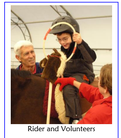
Rider and Volunteers

Each rider's individually created program is supervised and evaluated by therapists that are specially trained using the horse as a therapeutic tool. In addition to the physical gains from horseback therapy, parents and teachers often see improved speech patterns and lengthened attention spans. Our riders gain a sense of joy, freedom and empowerment from the therapy sessions, which enable them to sit tall and proud on the backs of our specially screened and trained horses.